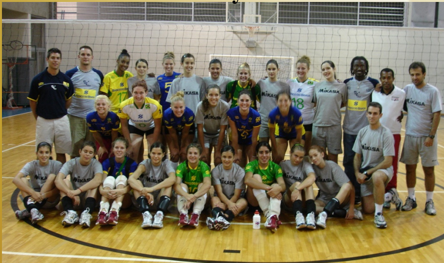
Newberry and Portugal Youth team