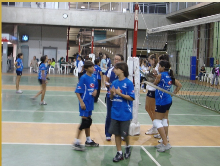
Small courts with mini nets