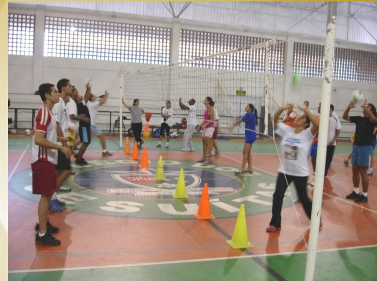
Working with coaches (adults) and with children (real situations)